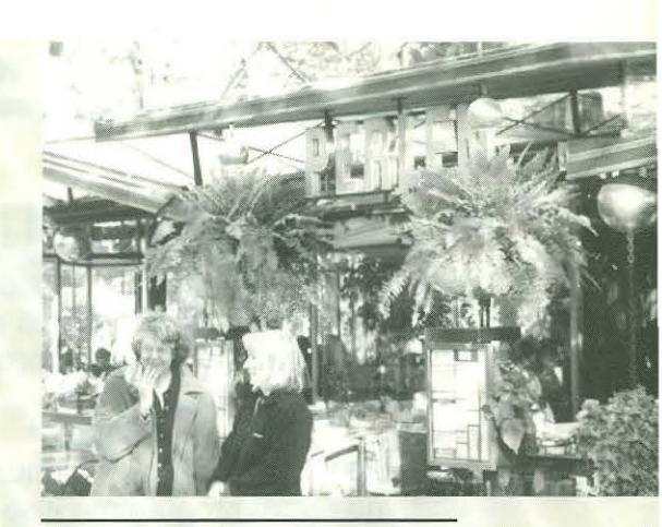
Out front of the restaurant

We at Novo Nordisk send our warmest regards to all the delegates at the EMWA meeting in Copenhagen. It was a pleasure sponsoring the meeting and seeing you all here in Copenhagen.